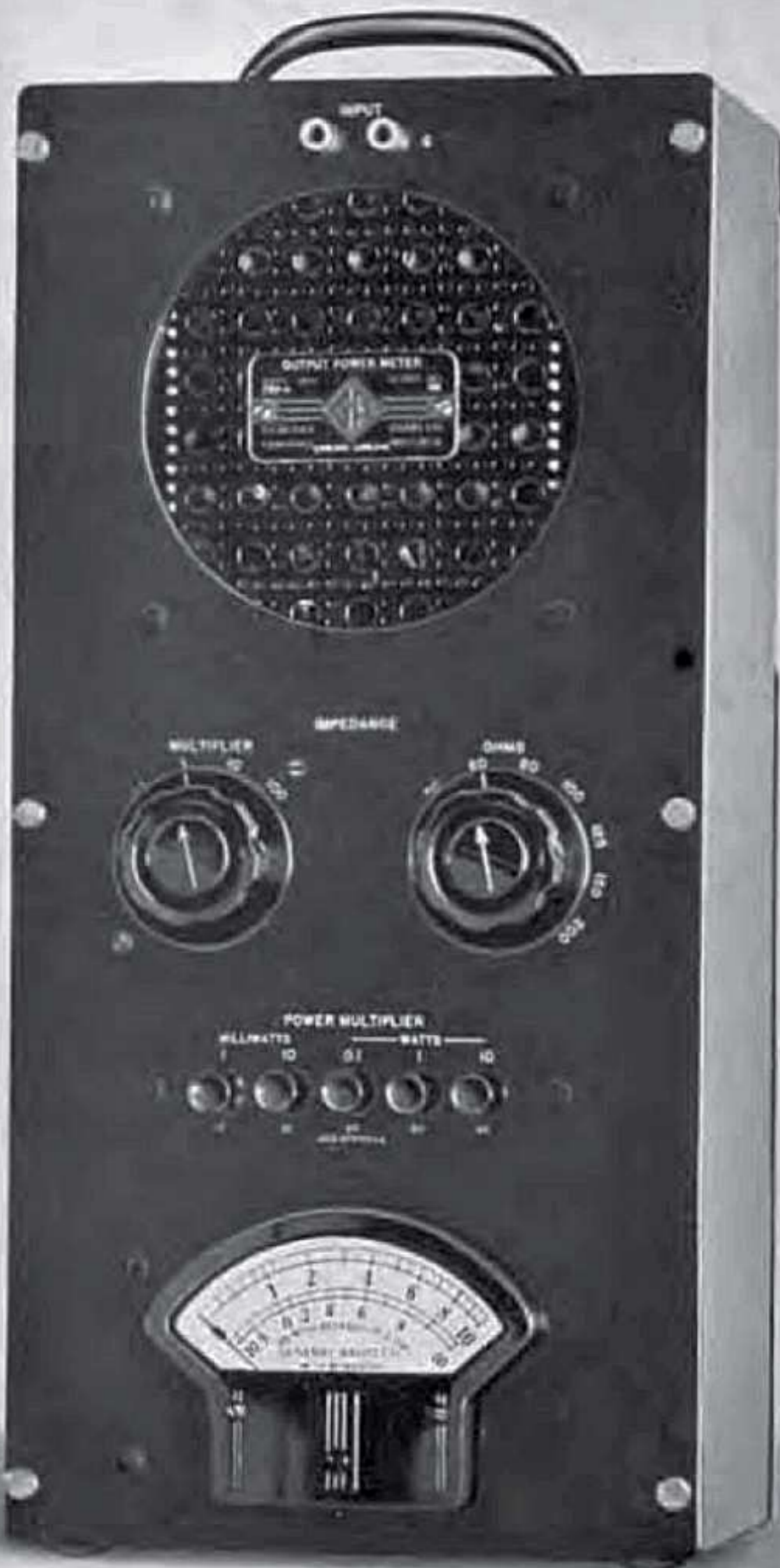
FIGURE 1. Panel view of the TYPE 783-A Output Power Meter.

It has been evident recently that there exists a field for an instrument of the same type but capable of dissipating greater amounts of power, and the new TYPE 783-A Output Power Meter has been designed to meet this need.